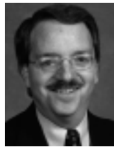
GRAY Personality Preferences Scale."