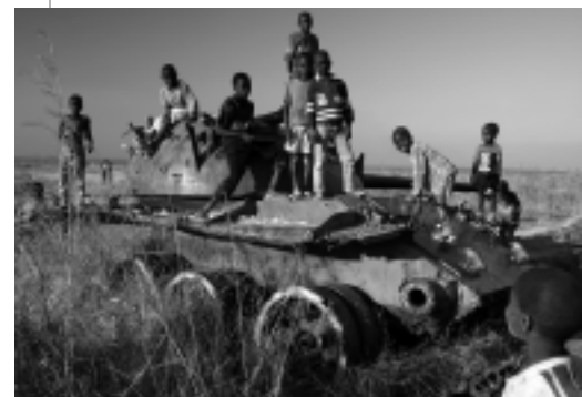
Children in Angola bear the brunt of the decades-long civil war.